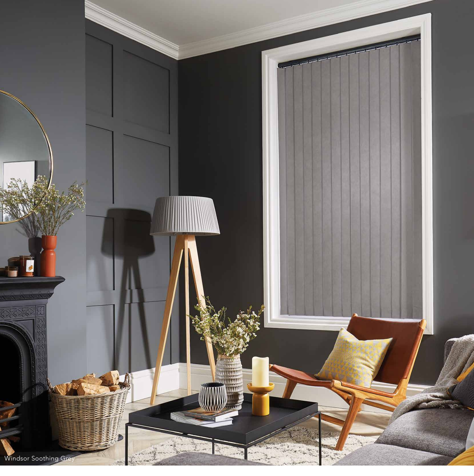
View the full collection by visiting your local stockist or our website, where you can order complimentary fabric samples. www.louvolite.com